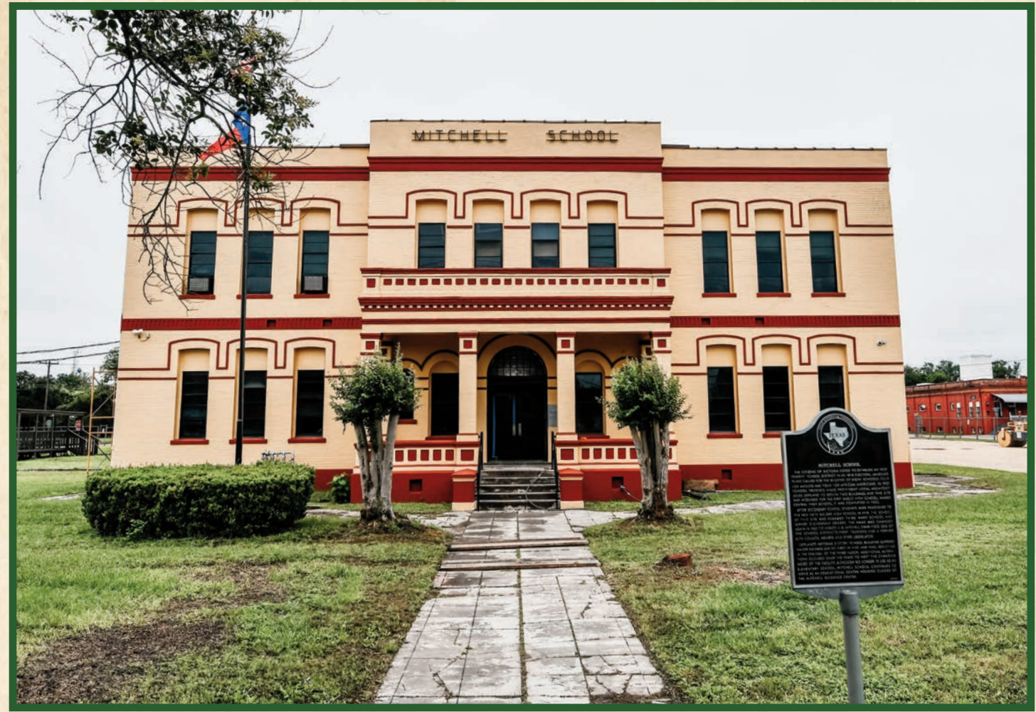
HISTORIC MITCHELL SCHOOL BUILDING